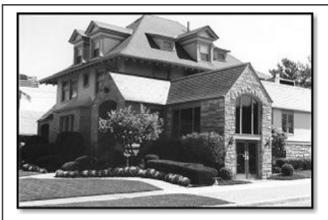
McGorray Bros. Funeral Home